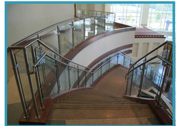
Hand Railing Job