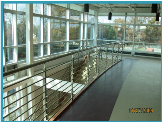
Cable Railing Job

Ted Turner Company, Inc. has over 30 years of experience fabricating, erecting, and installing custom handrails as well as cladding structures, using stainless steel, aluminum, bronze, brass, and powder-coated steel. The use of laser and water jetting technology enables us to create products that were, just a short time ago, unachievable.